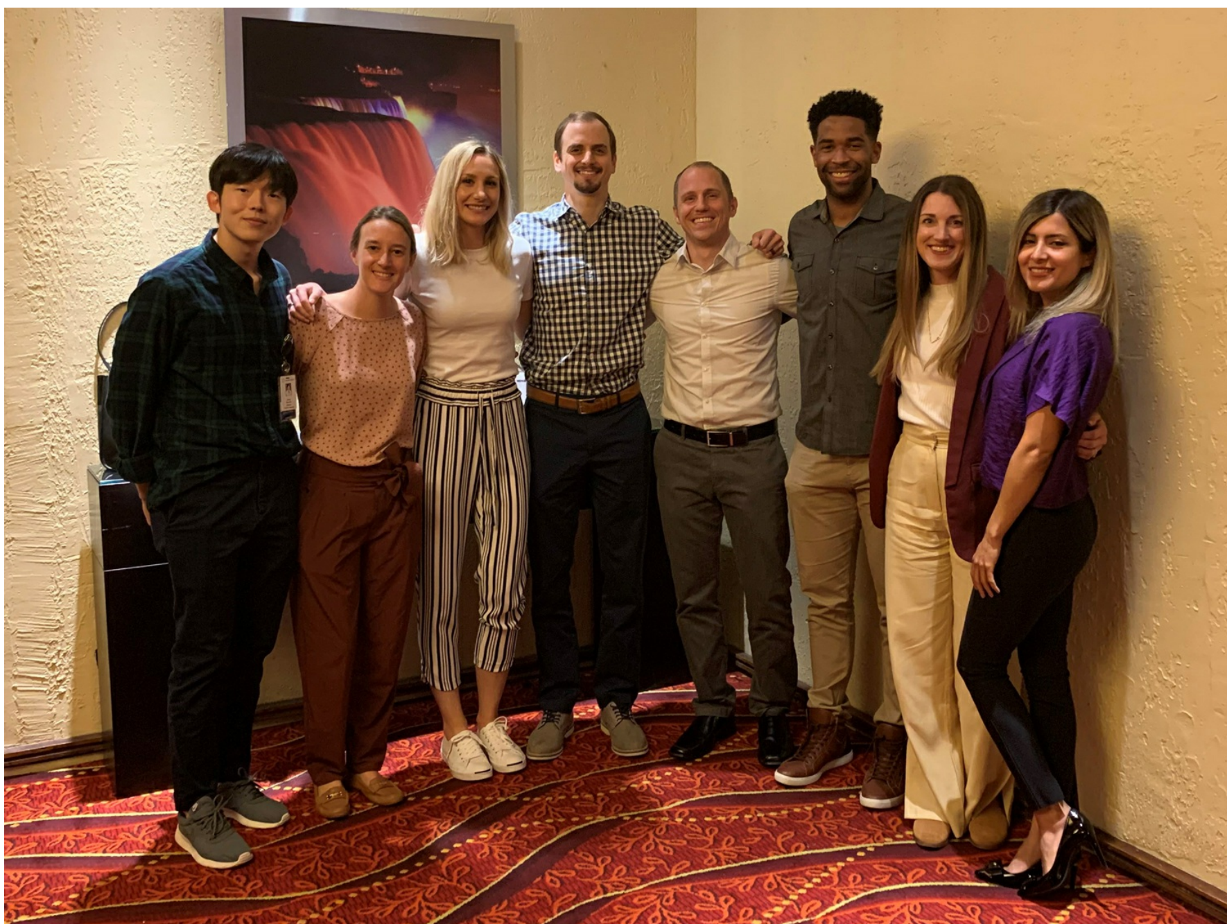
2021 New Residents in the Advanced Education in the Pediatric Dentistry Program