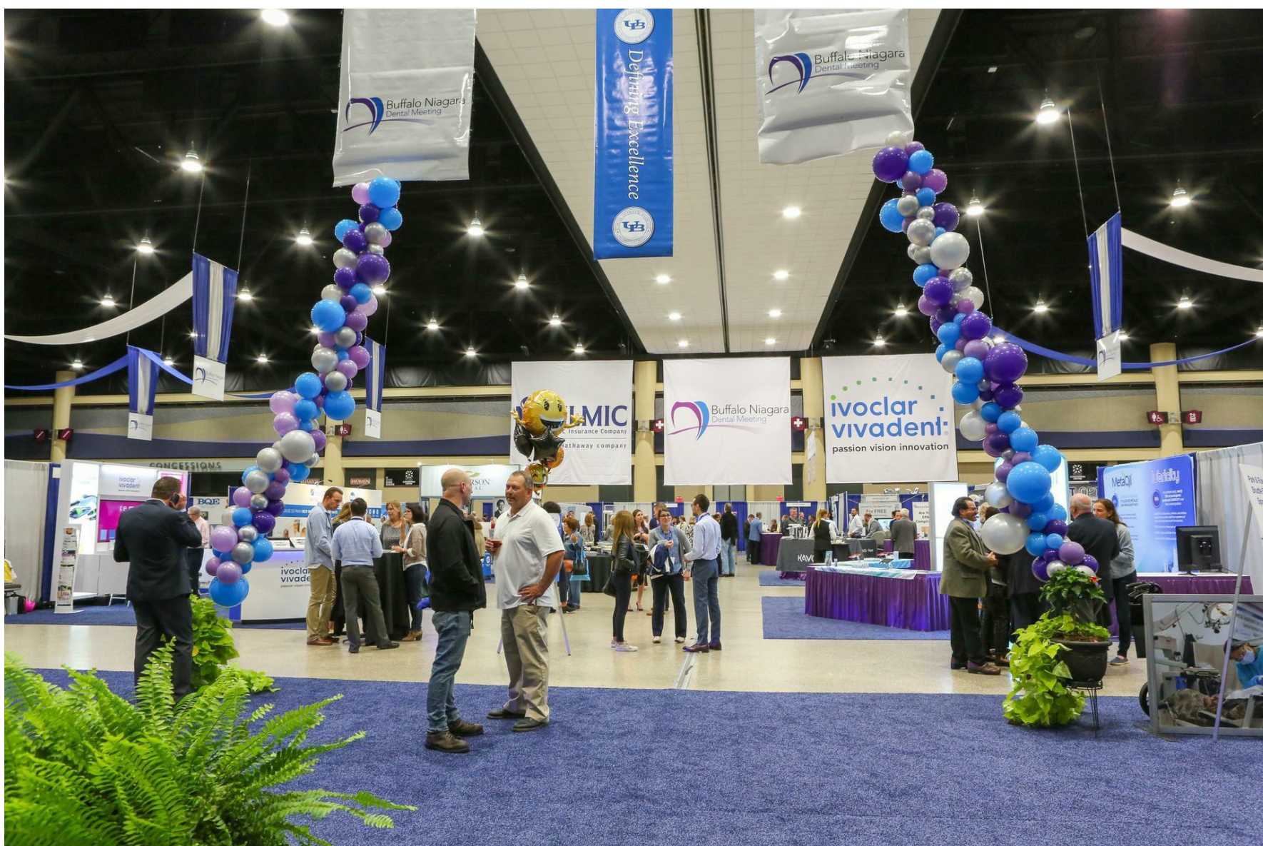
2019 Buffalo Niagara Dental Meeting

Pre-registration is now open! Click here to register